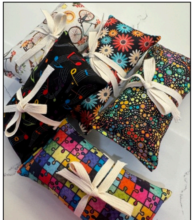
Completed seatbelt tie port pillows for AdventHealth.

Happy Spring! Looking forward to seeing folks at the April meeting. We will be stuffing and hand-stitching pillows and bears. I also have some completed seatbelt tie port pillows that were requested by AdventHealth this past week. These pillows protect port sites of patients when they tie them on their car seatbelts. These little projects are great for using up our scrap fabric. See you soon!