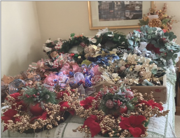
Donated wreaths ready for delivery to Windsor Assisted Living.

The wreath collection for the Festival of Wreaths has been a huge success. The wreaths will be delivered on December 1 to the Windsor Assisted Living Facility. Reminder that the actual event will be held at the Windsor, 50 Town Center on Sunday, December 7 from 1:30-3:00pm. Consider going and purchasing a new wreath for your home decor to benefit the shelter