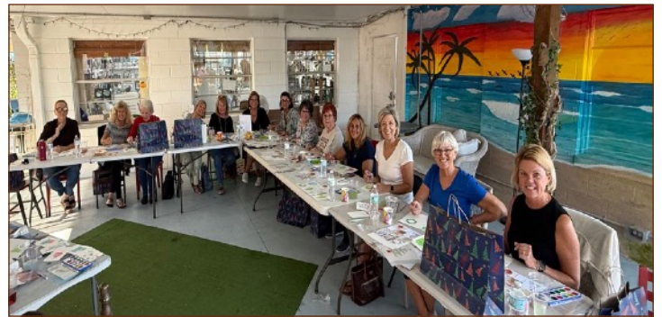
Watercolor class at GOLA - November 14th, 2025

Hope everyone enjoyed the Thanksgiving Holiday! Our group enjoyed some fun activities in November as well. Our Watercolor Paint Class at GOLA making Holiday Cards was awesome. Fourteen of us learned different ways to highlight and paint our cards...some very creative ladies in our group!