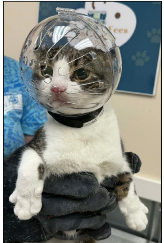
Cat getting ready to have her nails clipped.