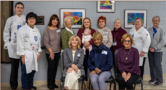
Attendees of the Flagler High School tour enjoyed a lunch prepared and served by students.

The Flagler County Education Foundation hosted 11 of our members on a tour of Rymfire Elementary School and Flagler Palm Coast High School showcasing the wonderful programs available in our school district. We were all impressed by all of the positive messaging all over the school and the impact of technology in today's classrooms. We enjoyed a perfect lunch prepared and served by the culinary class at Flagler Palm Coast High School.