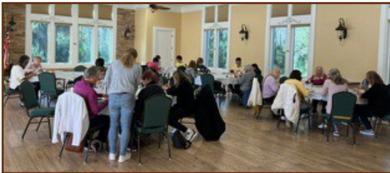
Ladies hard at work at the January 29th Mosaic Craft Party.