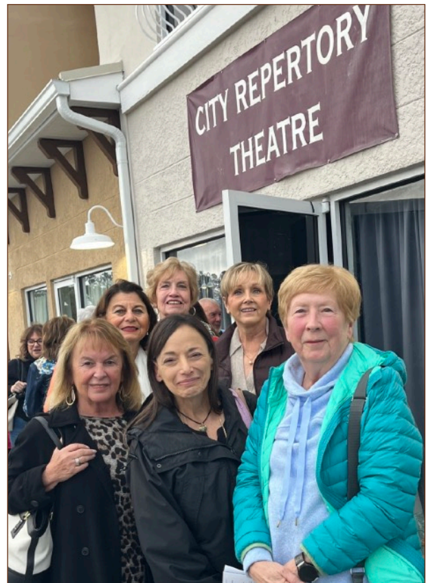
January 18th GHWC ladies attend Lady's Day at City Repertory Theatre in Palm Coast.