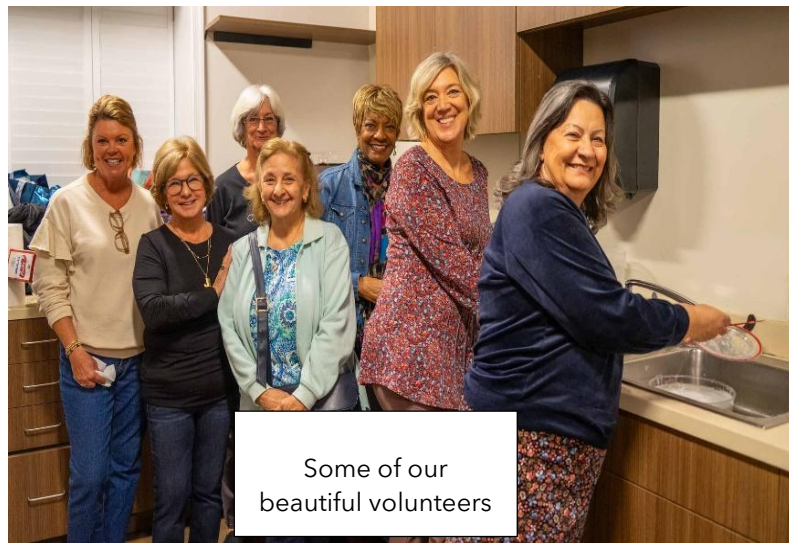
Some of our beautiful volunteers

More photos can be seen on the website at: https://www.ghwomansclub.org/