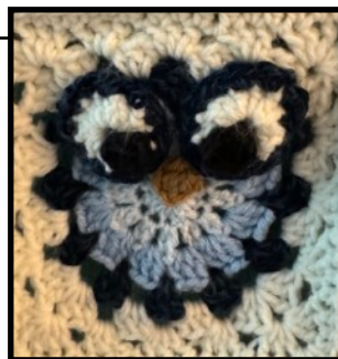
Can you see the cute owl?

The grand total number of hours spent by the Material Girls sewing, stuffing, crocheting, knitting and supporting projects for the community this year was 3,649 hours. This past year was a record year for in-kind donations. Donations to the Material Girls included fabric, yarn, ribbons, embellishments, thread, crochet hooks and knitting needles. In-kind completed items made by the Material Girls and donated to the community included crocheted, knitted and quilted blankets/throws and baby hats and booties, stuffed bears, chemo tie pillows, abdominal pillows, drain pouches, radiation pillows, Christmas stockings, chapel kneelers, washcloths, bandanas, mini tissue holders and mini origami book bags. The grand total for 2023 in-kind donations was $8,467.