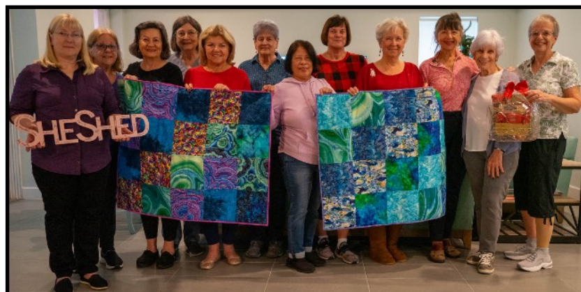
Attendees at the last Material Girls meeting in 2023.