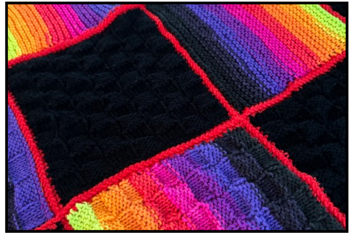
Fluorescent colored squares crocheted together in a throw for the Cancer Center by Karen Rodriques.