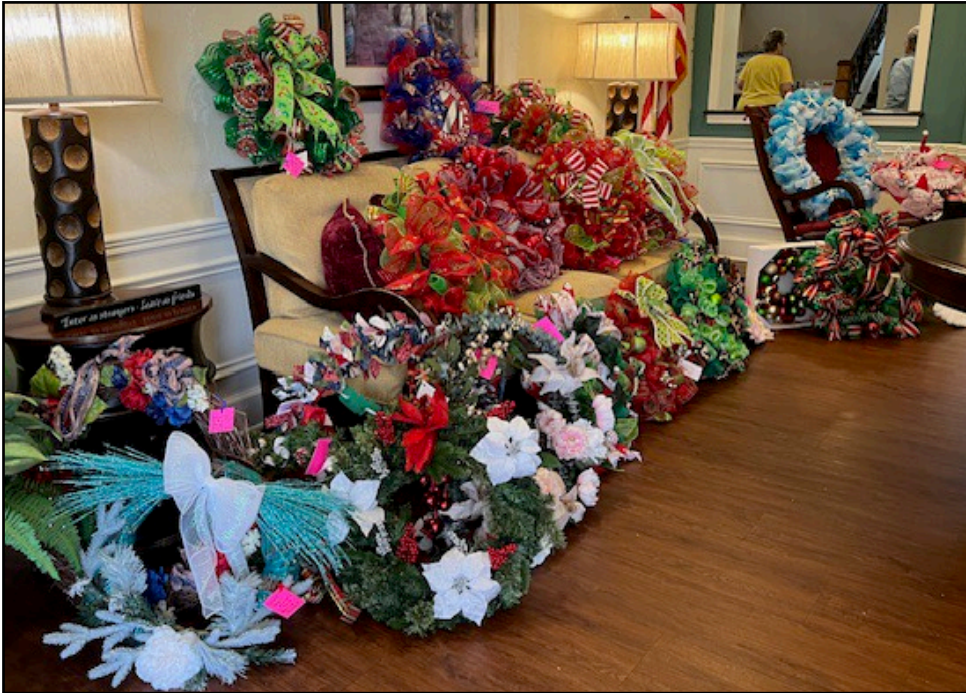
Wreaths waiting to be hung at The Windsor Assisted Living Facility. Wreaths will be on display until December 3rd when visitors to the facility can purchase wreath benefitting the Flagler Humane Society from 1-3 p.m.