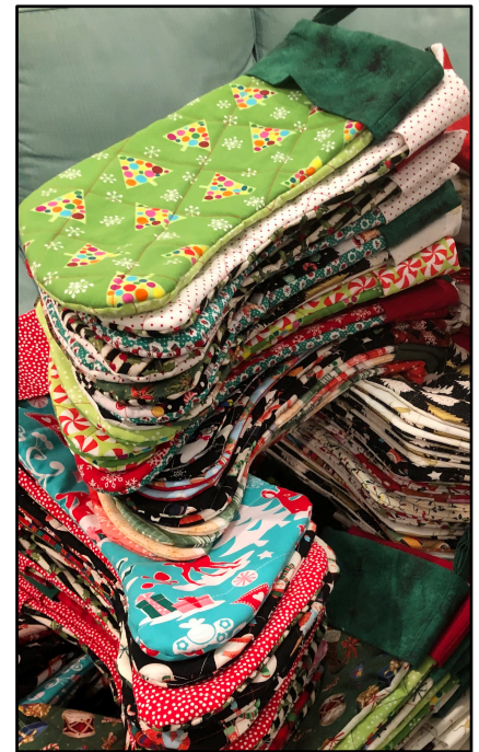
Stockings will be distributed by “Christmas Come True” to Flagler County children.

Many thanks to the wonderful sewers who have made and continue to make stockings for this program - these are very much appreciated stockings! I will drop off the remainder of stockings in late October/early November.