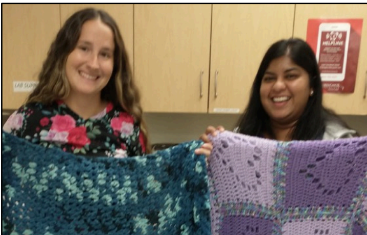
The Women, Infants, and Children County Health Department, (WIC) Employees are excited to receive items for their clients.