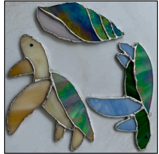
Shell and turtles made at the GOLA stained glass making class.