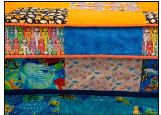
Stockings, bibs, baby hats and quilts to be donated to "Christmas Come True" and WIC.