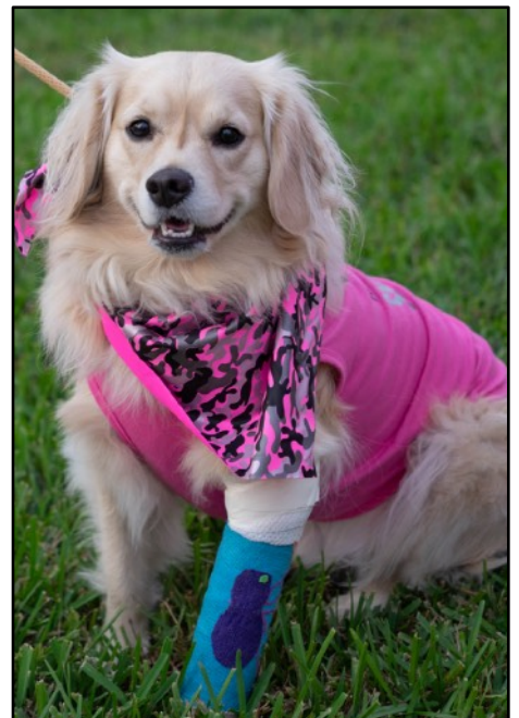
One of the cute dogs who attended the "Pink on Parade" this October at AdventHealth. Bandana was donated by the Material Girls.