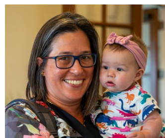
Our youngest recruit